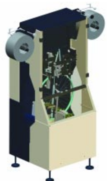
HT Qtape applicator

The stabilizing machine can be optionalized with a QTape® application unit, which applies the rim tape before truing (see separate paragraph).