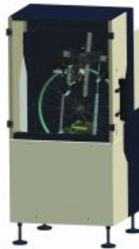
HL Locking compound applicator

The CN Inline Lacer has a very versatile nipple application unit, which makes the machine suitable for big hubs in small-diameter rims, like electric hub motors, 12 1/2 inch wheels or light motorcycle wheels. In these wheels, the spokes make narrow angles with the rim bed. Of course, the machine has all the assets of the other single and intelligent lacers, and will store every type of wheel made in its memory for future use.