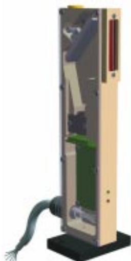
ISL PST / SL Cam