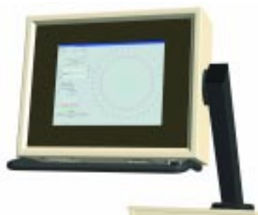
SG Touch Screen

tightening machine as the first step in automation. The SMT can true high end wheels within 0.05 mm height and side deviation and wheels where the machine cannot reach the nipples, for instance the inverted-type spoking with spoke heads in rims and nipples in the hub. It is also possible to make a printout of the wheel information and trueing parameters. This certificate can be shipped with the finished wheel.