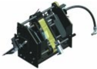
HFS Hub filler

Holland Mechanics has a neat little machine which tapes the spokes which are inserted in the hubs into two bundles for easy transport. Like the HM hub trolleys, they are helpful intermediates.