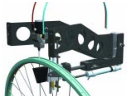
HL Locking compound applicator