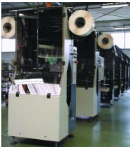
Big market demand for new Rimtaper, machines are build up in series of 6.